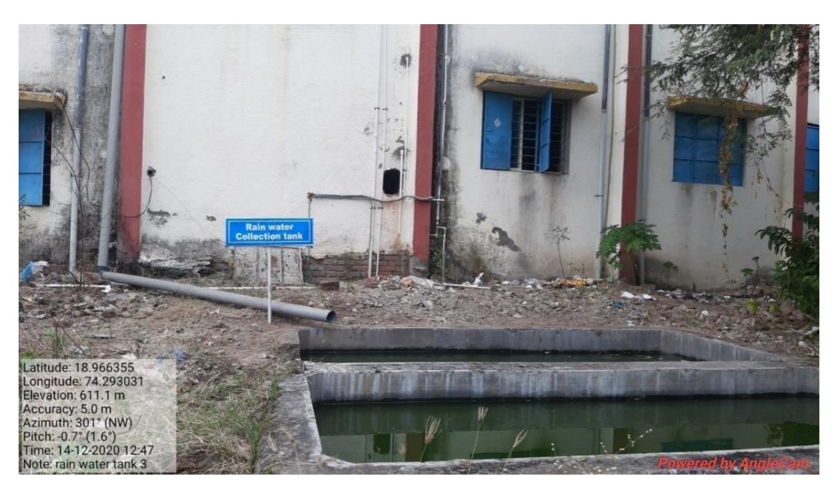
Photograph of Pipe channel system for Rain Water harvesting with tank

Phone- (02488) 230438 E-mail: ascnighoj@gmail.com