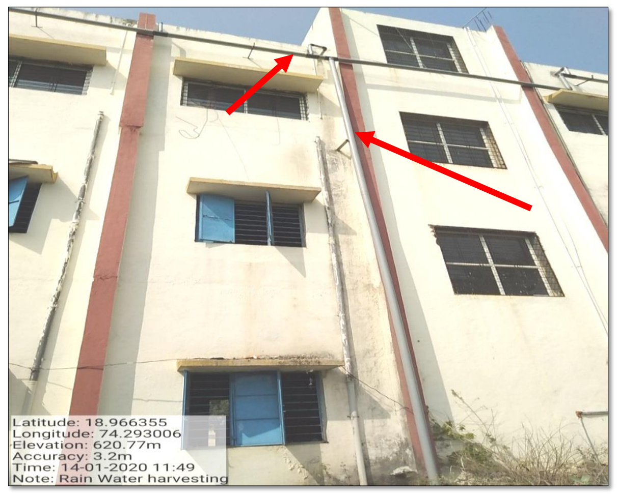
Photograph of Pipe Channel System for Rain Water Harvesting

1. Rain water harvesting 2. Construction of tanks