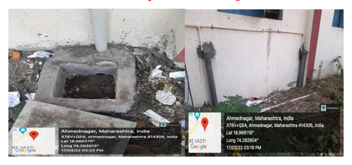
System of liquid wastes of laboratories