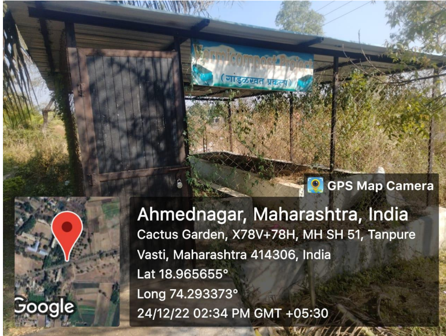
Photograph of Vermicompost unit