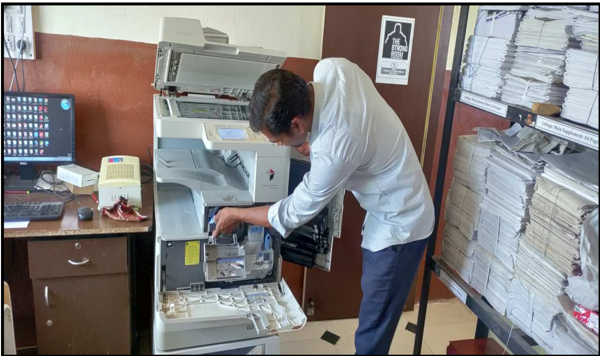
Maintenance of instruments