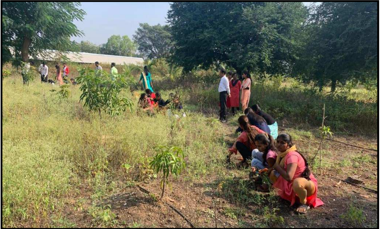
Removing unwanted grasses