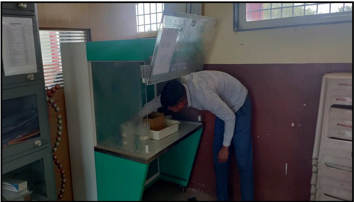
Cleaning of instruments