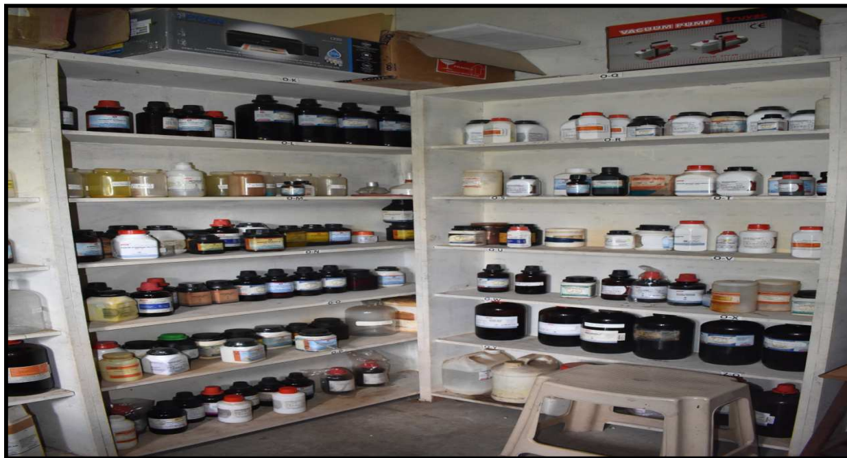
Chemical Store Room