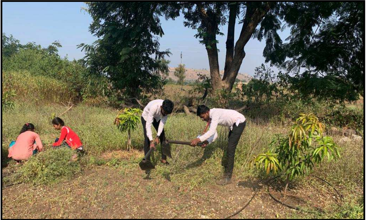
Removing unwanted grasses