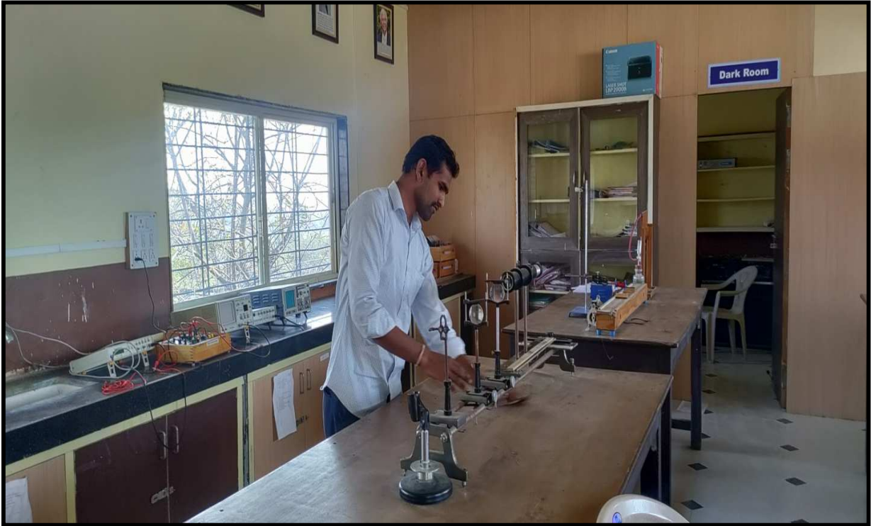
Maintenance of instruments