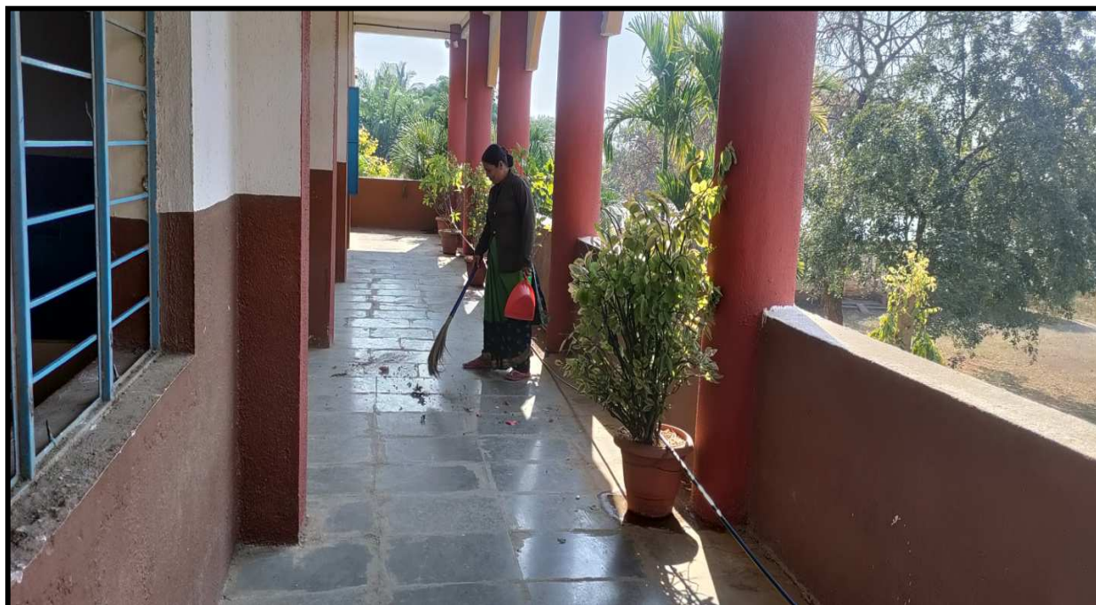
Cleaning of common passage