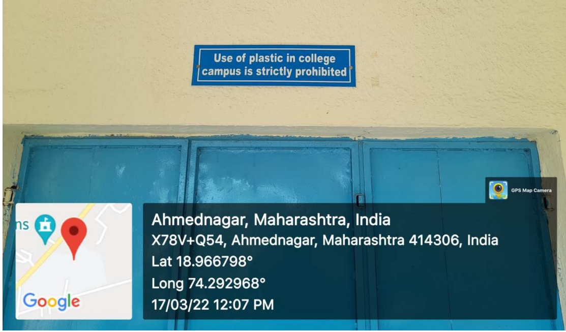
The photograph of signboard "Plastic Ban" - Building B(Library)