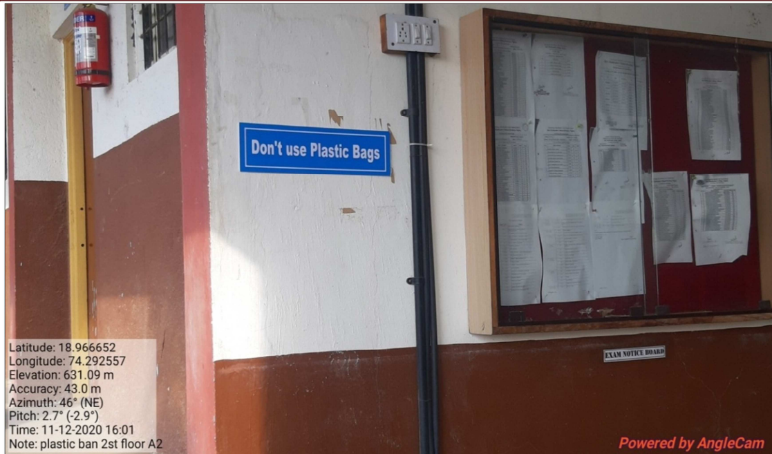
The photograph of signboard "Plastic Ban" fitted on Building A, 2nd floor