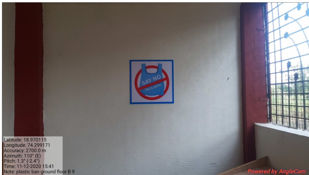
The photograph of signboard "Plastic Ban" - Building B

[Signature] PRINCIPAL Shri. Mulikadevi Mahavidyalay, Nighoj Tal: Parner, Dist. Ahmednagar-414306