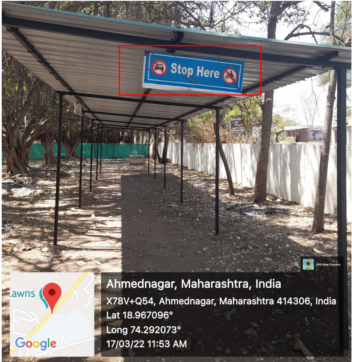
Photograph of signboard of “Stop Here” for automobile