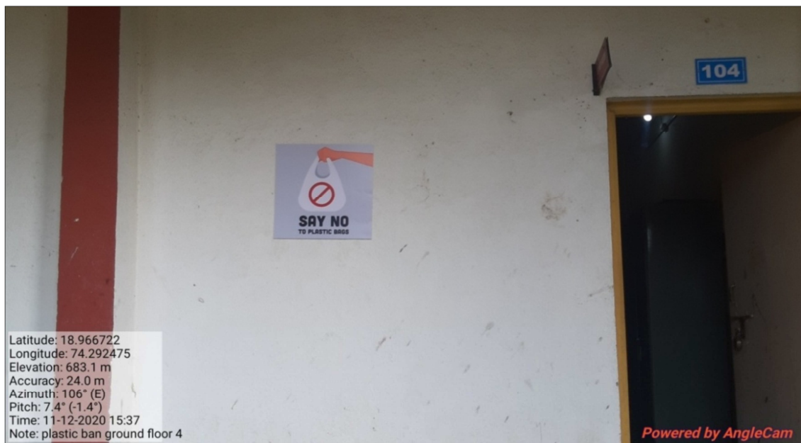
The photograph of signboard showing “Plastic Ban”