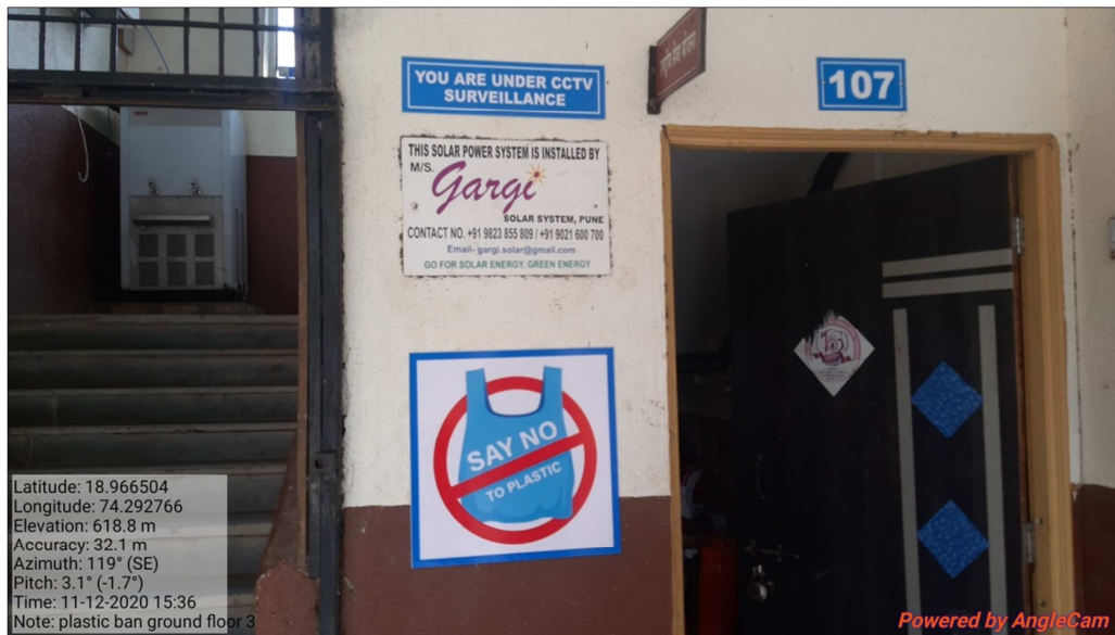
The photograph of signboard showing “Plastic Ban”