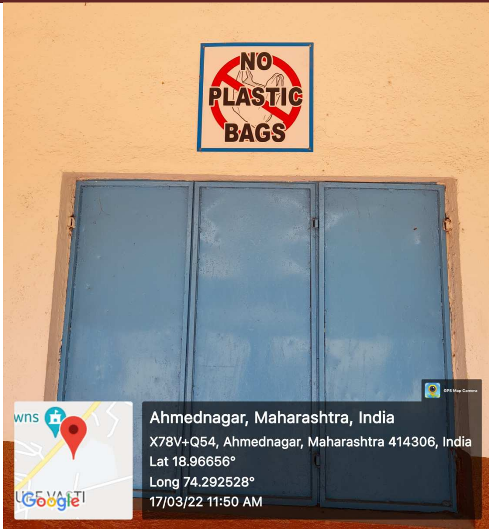
The photograph of signboard showing “Plastic Ban”