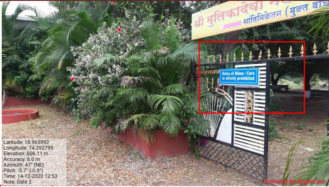
Photograph of signboard