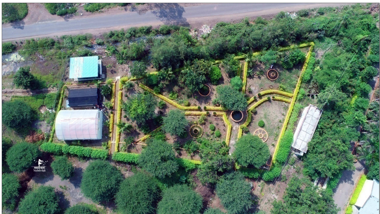
Arial view of botanical garden

[Signature] PRINCIPAL Shri. Mulikadevi Mahavidyalaya, Nighoj Tal: Parner, Dist. Ahmednagar-414306