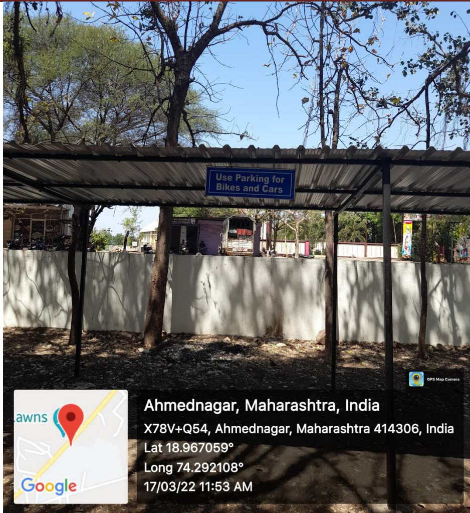
Photograph of signboard