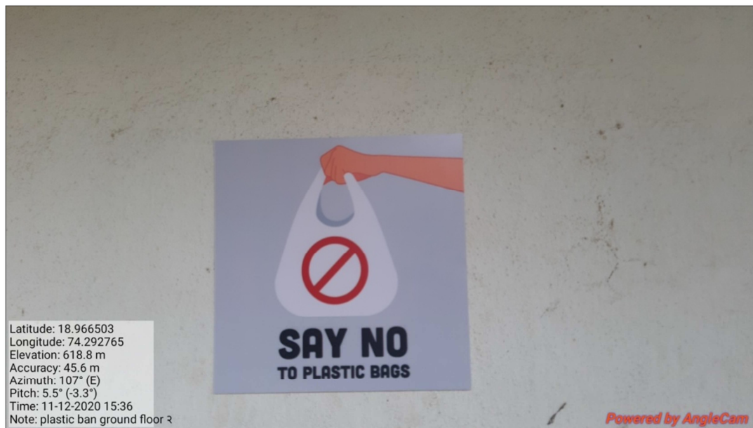
The photograph of signboard showing “Plastic Ban”