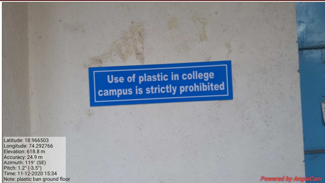
The photograph of signboard showing “Plastic Ban”