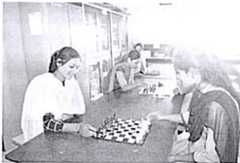
Photograph of Students Play Chess

Athletics provides athletes with several benefits including the acquisition of valuable life skills that will benefit them throughout their life. Athletics play a key role in school or college. A magnificent sport was organized at our college, on dated, 20 th to 22 th January 2021 . There are 33 students were participated in this game.