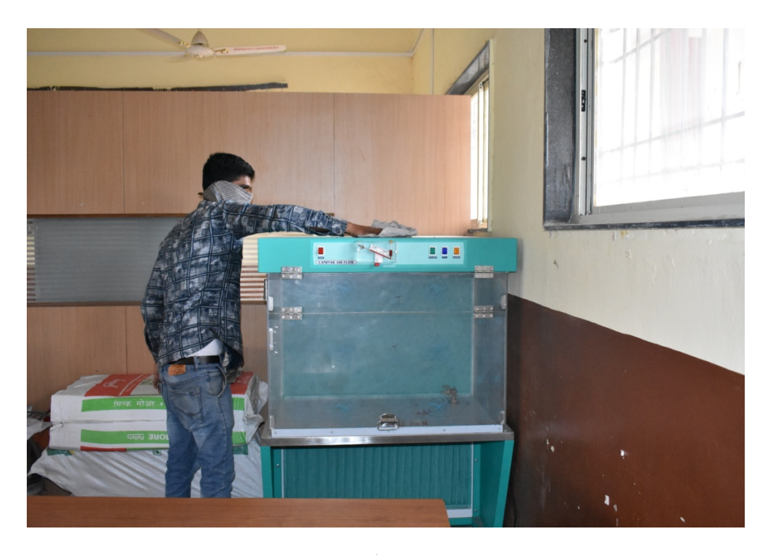
Cleaning of instruments