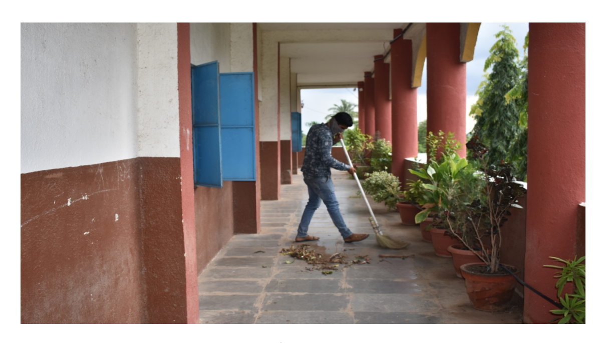
Cleaning of common passage