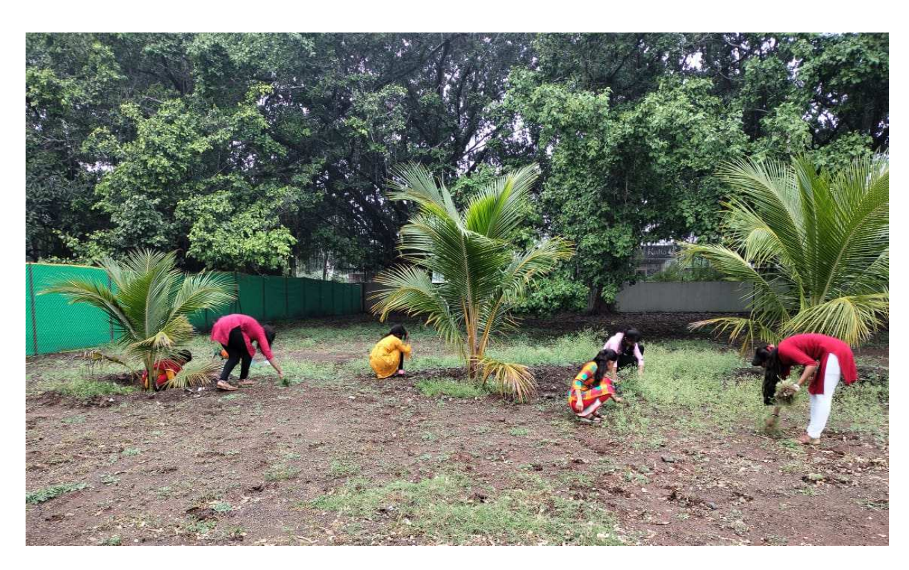
Removing unwanted grasses