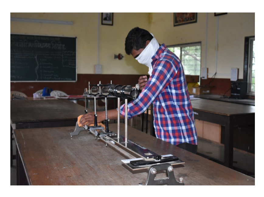
Maintenance of instruments