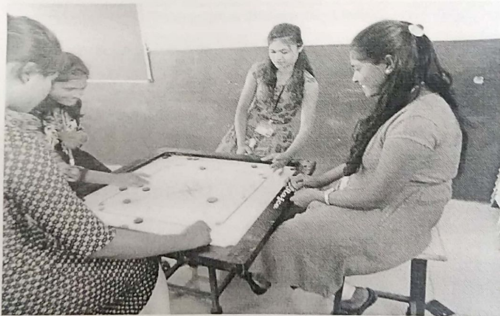
Photograph of Students Play Carrom