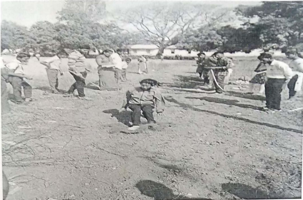
Photograph of Students Play Long Jump