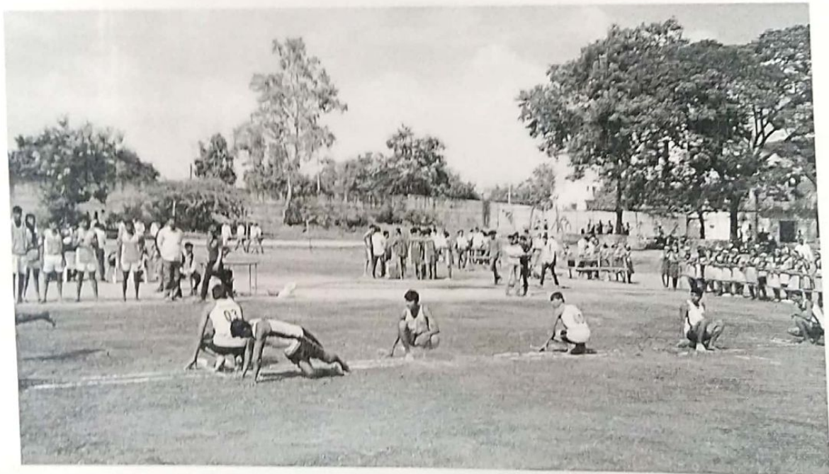
Photograph of Students Play Kho-Kho