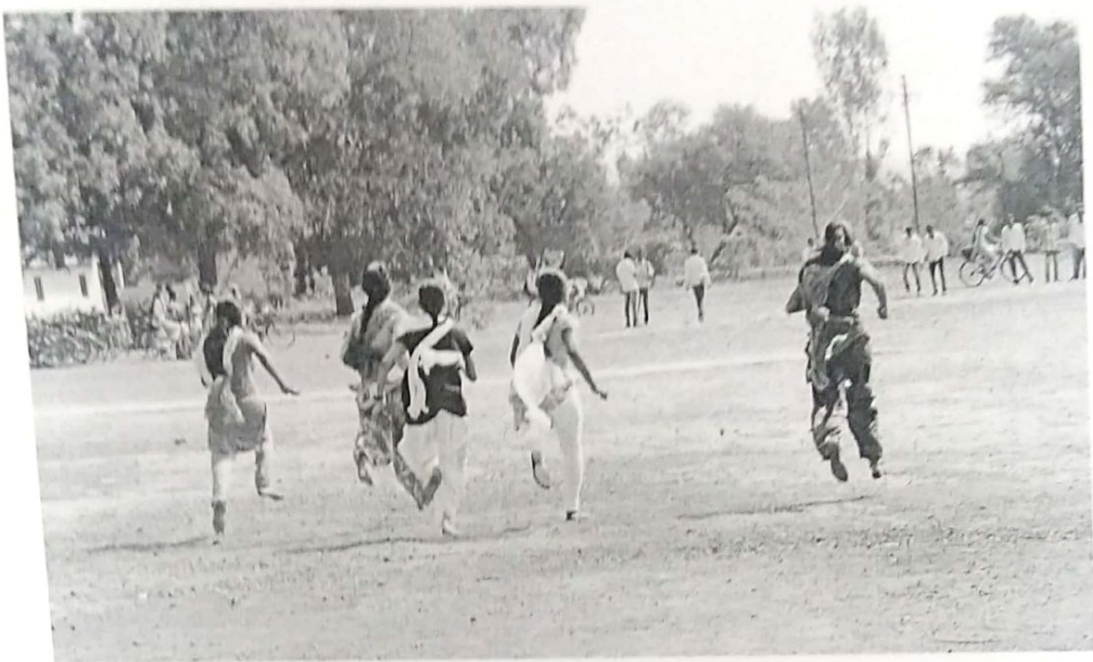
Photograph of Students Play Athletics games (100 mt. Run)