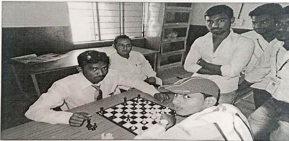
Photograph of Students Play Chess