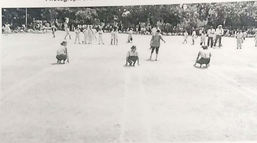
Photograph of Students Play Kho-Kho