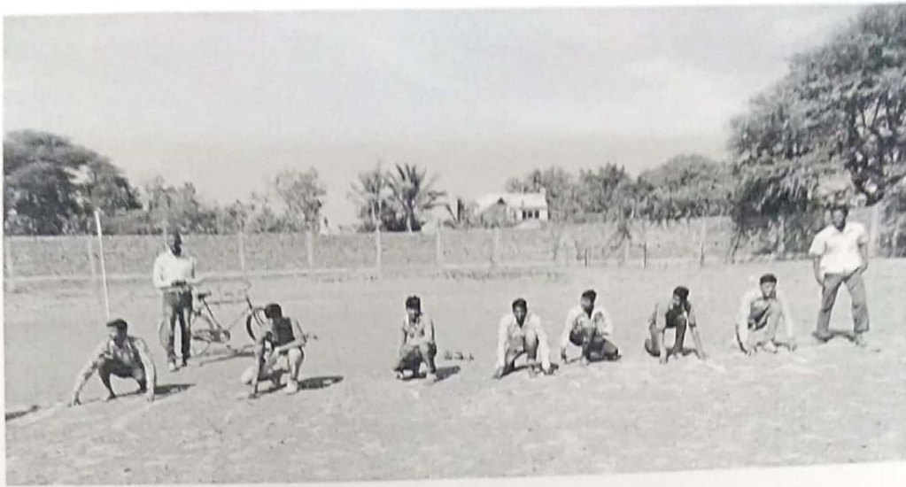
Photograph of Students Participated in Athletics games