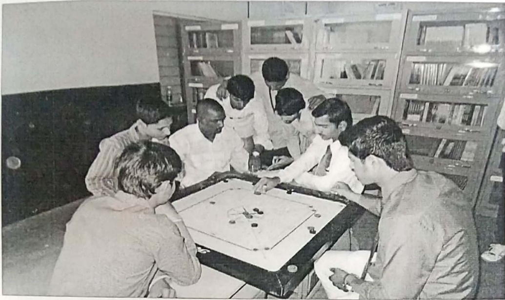
Photograph of Students Play Carrom