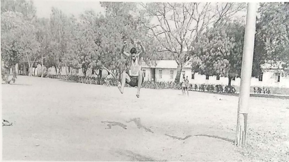
Photograph of Students Play Long Jump

Carom is a board game played by 2 or 4 platers. Carom is the game of fingers that make you win or lose the game. This programme was organized on 17 January 2015.